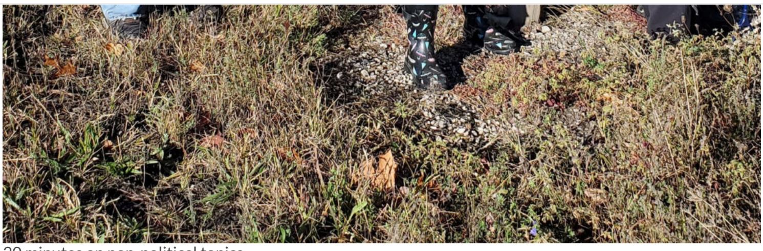
20 minutes on non-political topics.

"We work hard, but we try to have fun, too," Lyle says. "It is a great way to help the community but also network with people."