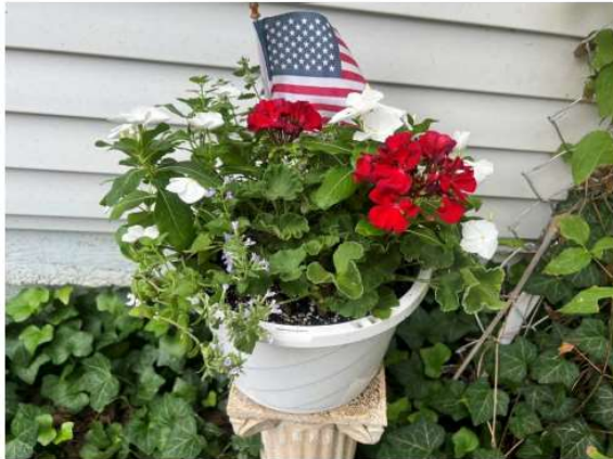
(This is representative only of the Patriot Pot)

AMERICA IS CELEBRATING ITS 250 th ANNIVERSARY IN 2026 Jefferson City Host Lions Club in cooperation with the Cole County 250 th Anniversary Committee want to beautify Cole County with containers of red, white, and blue flowers.