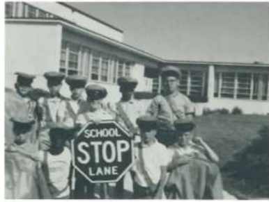
Moreau Heights Patrol