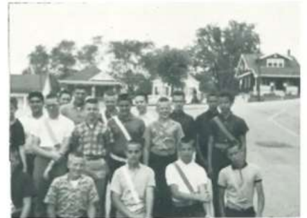
Immaculate Conception Patrol