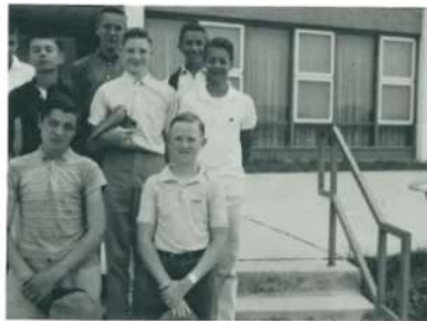
Lutheran School Patrol