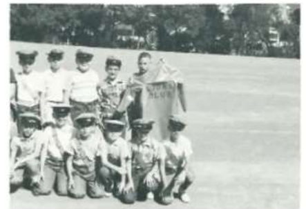
East School Patrol