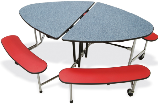
Model # ST-4872-C429