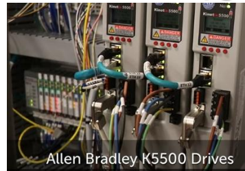
Allen Bradley K5500 Drives