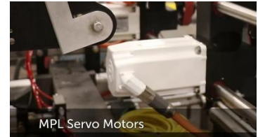
MPL Servo Motors