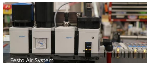
Festo Air System