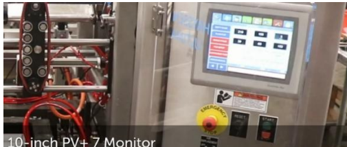
10-inch PV+ 7 Monitor