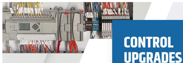
Before - Older Hayssen dedicated Proprietary push button controls.

By choosing reconditioning over replacement, you contribute to a sustainable future by reducing waste and conserving valuable resources.