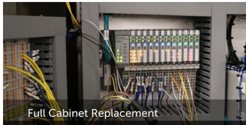
Full Cabinet Replacement