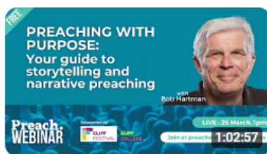
Preaching with Purpose: Bob Hartman's Guide to Storytelling