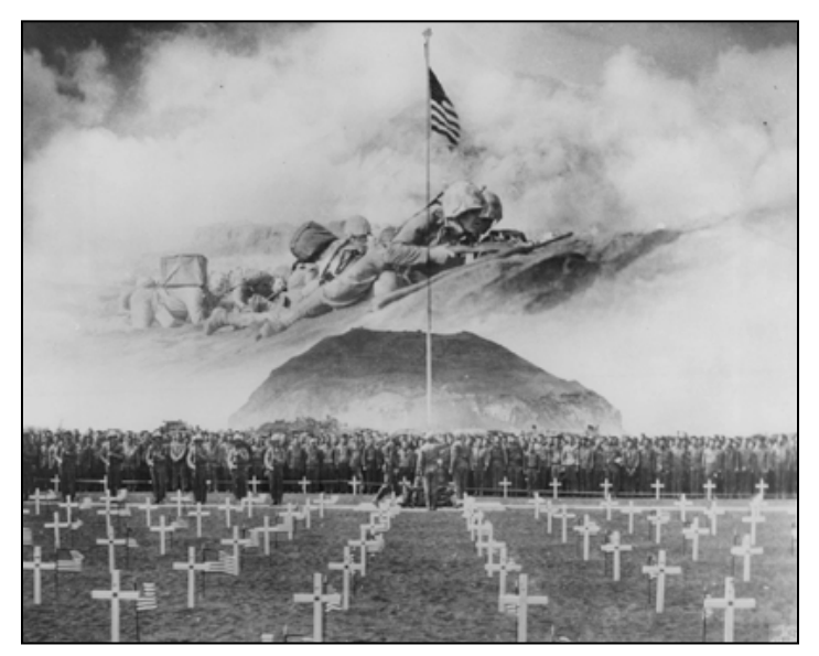
The Spirit of Iwo Jima, honoring the Marines of the 5th Amphibious Corps who conquered this critical objective of World War II.