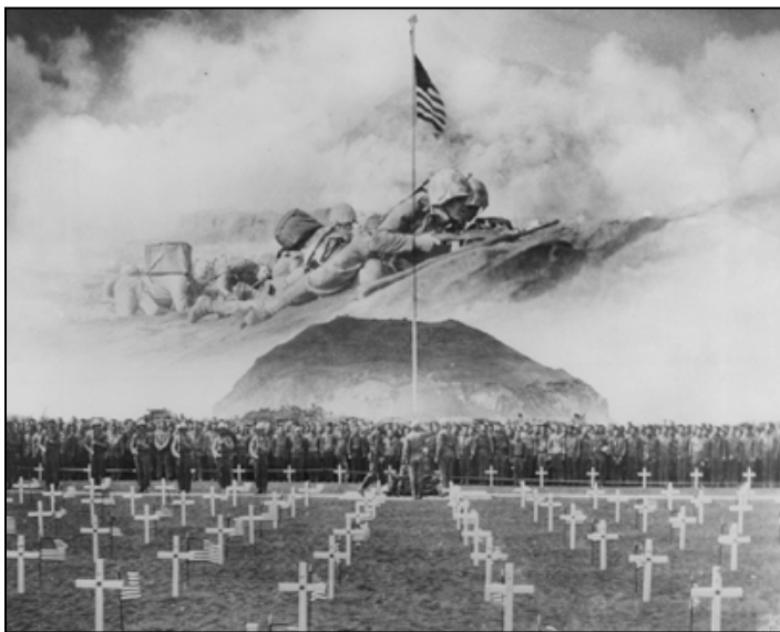
The Spirit of Iwo Jima, honoring the Marines of the 5th Amphibious Corps who conquered this critical objective of World War II.