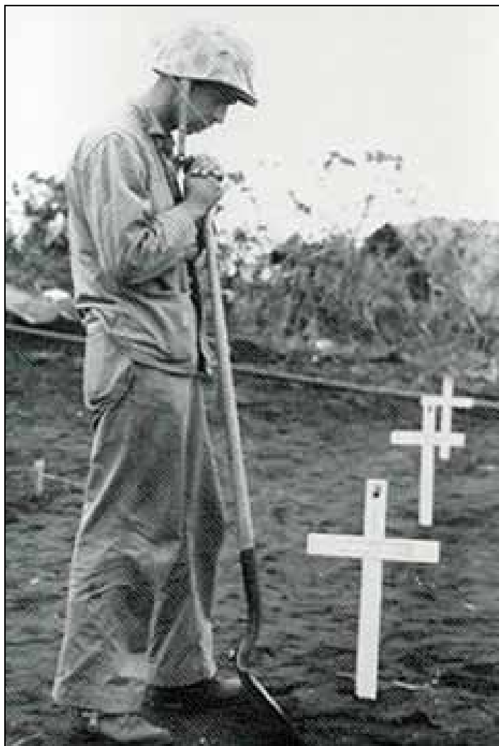
A Marine stands at the grave of GySgt John M. Basilone, killed in action on D-Day at Iwo Jima on 19 February 1945.