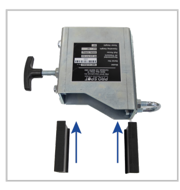
NOTE: When replacing the slider rails, place them so the edges will hold the tower edges. The sliders go between the bolts on the inside of the slider.