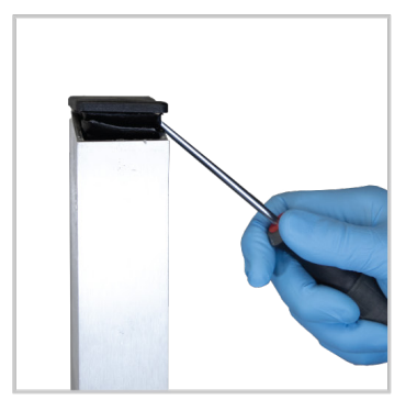
6b. Use flat head screw driver to remove plastic cap on top of tower.

6. WINCH INSTALLATION 6a. Remove the bolt from the top of the tower.