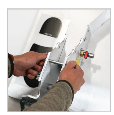
1. BOLT REMOVAL Remove the nut, bolt & washer from the vertical base walls.