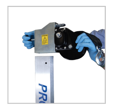
6d. Position slider rails inside of the slider and replace the winch/slider assembly on the tower. Tighten lock down screw to secure the tower.