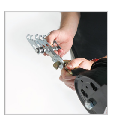
8. INSTALL HOOK Place the multi hook attachment onto the winch hook.

6c. Attach the winch to the slider using attachment bolts and 17mm open end wrenches.