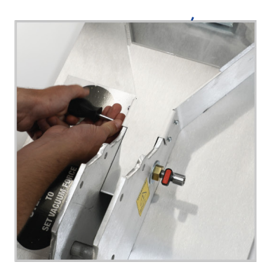
2. COVER REMOVAL Unscrew 4 screws to remove the venturi cover.

Reinstall the venturi cover using the same screws and the power drill to tighten the screws.