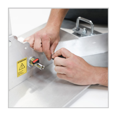
5. REINSTALL THE VENTURI COVER

Reinstall the venturi cover using the same screws and the power drill to tighten the screws.