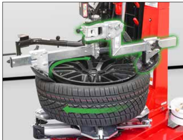
The flip down, fixed bead press arm adds additional contact to service the most extreme low-profile tires and deep drop-center wheels.