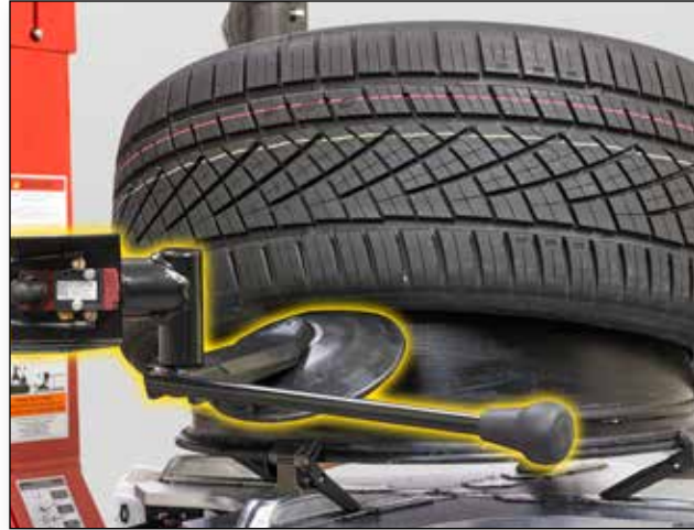
The bottom roller disc can be used for bottom bead re loosening, demounting or match mounting.