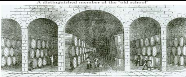
A distinguished member of the 'old school'