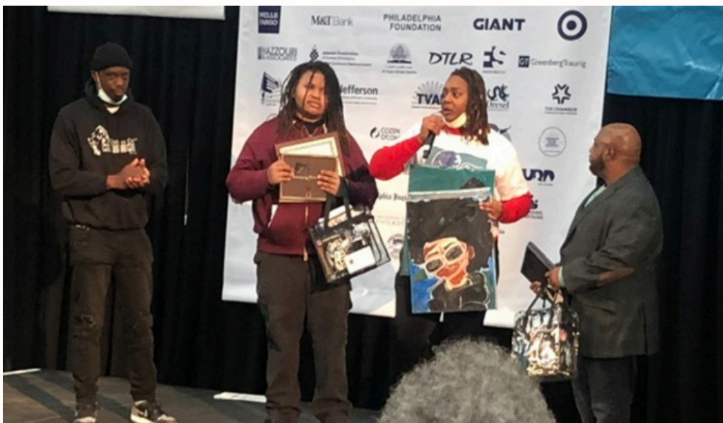
● Girard College Phila PA

Quarterly Newsletter: January-April May Edition