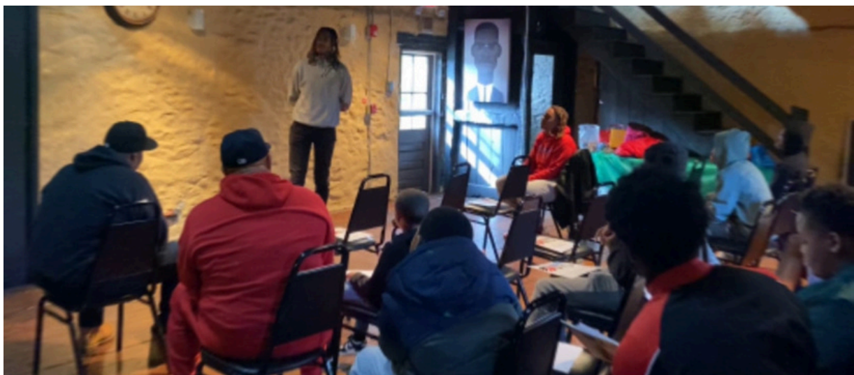
● Germantown Theater, * Men of Couraage Location VUOTS Serviced MOC From Feb.- April 2024

VUOTS is happy to say that a wonderful partnership has been made with MOC & VUOTS as it is both our mission to educate and empower. VUOTS has completed three months at this location and transitioned to another location as part of it's intiatives to "Teach Philly" & "Reach Philly"