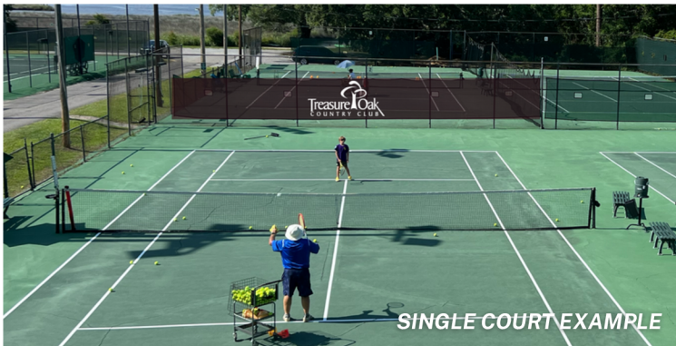
SINGLE COURT EXAMPLE

Reach out to Steve today for more information and to secure your spot! Email: toccpro@gmail.com | Phone: 228.327.3763