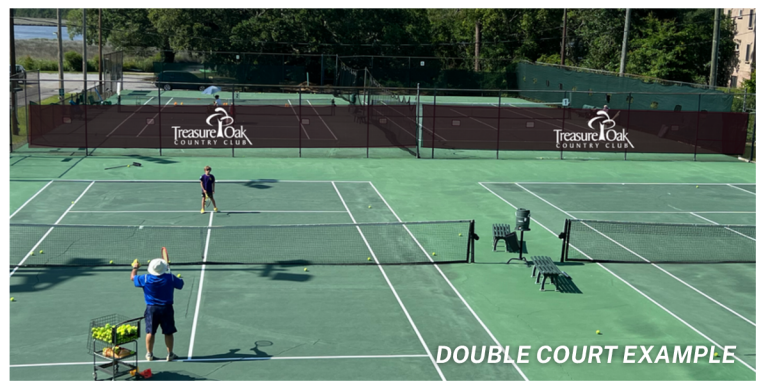
DOUBLE COURT EXAMPLE