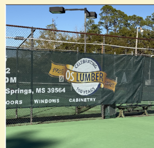
OCEAN SPRINGS LUMBER