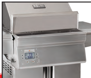
Front Loading Pellet Hopper

SEAR A STEAK? COOK A WOOD-FIRE PIZZA? SMOKE A BRISKET? ROAST A TURKEY? BAKE FRESH ARTISAN BREAD? IT'S ALL POSSIBLE ON A BEALE STREET GRILL, POWERED BY MEMPHIS