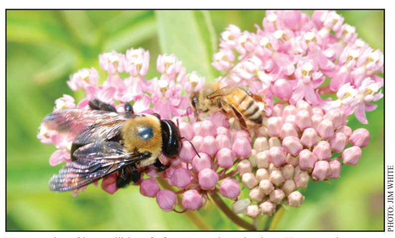
Many species of bees will benefit from a meadow planting. Here, a native carpenter bee ( Xylocopa sp.) and a European honeybee ( Apis mellifera ) nectar on swamp milkweed ( Asclepias incarnata ).

Before establishing a native meadow or buffer planting for bees, consider your long-term goals for the site and your level of commitment to maintaining an area specifically for bees and other wildlife. Native plant seed can be expensive, and a native meadow community can be relatively slow to establish. You should be willing to set the area aside for many years. Once the meadow is established, it will need relatively little maintenance, but will require monitoring and periodic maintenance including mowing, burning, and spot spraying to control weeds and woody growth and promote a healthy wildflower population.