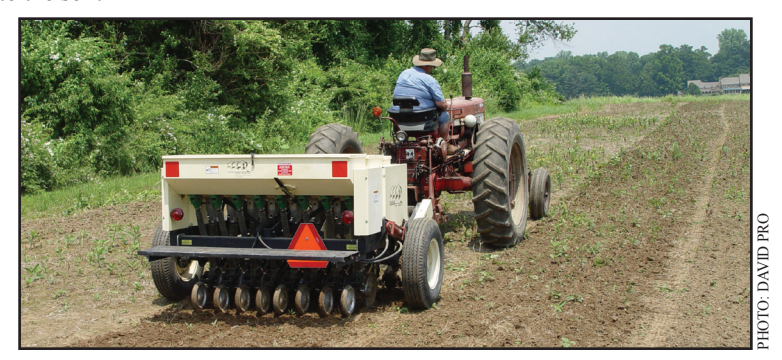
For large sites, a no-till drill is often the easiest and best way to plant seeds of meadow species.

No-till seeding requires access to a special no-till drill designed for planting warm-season grasses. Such a drill can often be borrowed (or rented for a nominal fee) from local conservation districts or local chapters of organizations such as Quail Unlimited or Pheasants Forever. Proper seed depth should be <sup>1</sup>/<sub>2</sub> inch