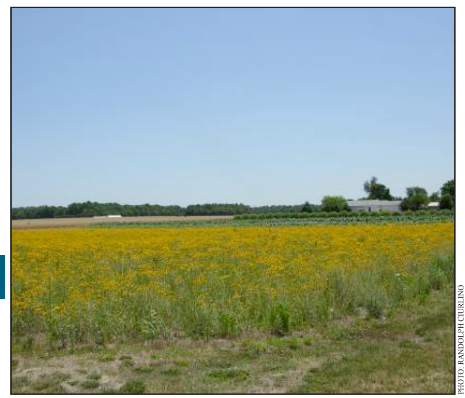
NRCS cost-share assistance may be available to establish plantings for bees.

Conservation cover Field border planting Filter strip planting Hedgerow planting Shallow-water wetland creation Wetland restoration Critical area planting Riparian herbaceous cover development Early successional habitat development Riparian forest buffer planting Upland / Wetland wildlife habitat management