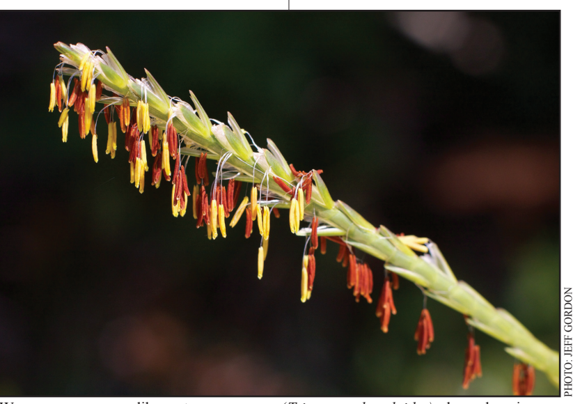
Warm-season grasses like eastern gamagrass ( Tripsacum dactyloides ), shown here in flower, are important and attractive components of a meadow planting.

The delivery of seed in a jet of water, often mixed with a mulch solution. If native seed is planted using this technique, the seed and water must be delivered first, then the mulch must be delivered in a subsequent application. Otherwise, the native seed is suspended in mulch, and is not in contact with the soil.