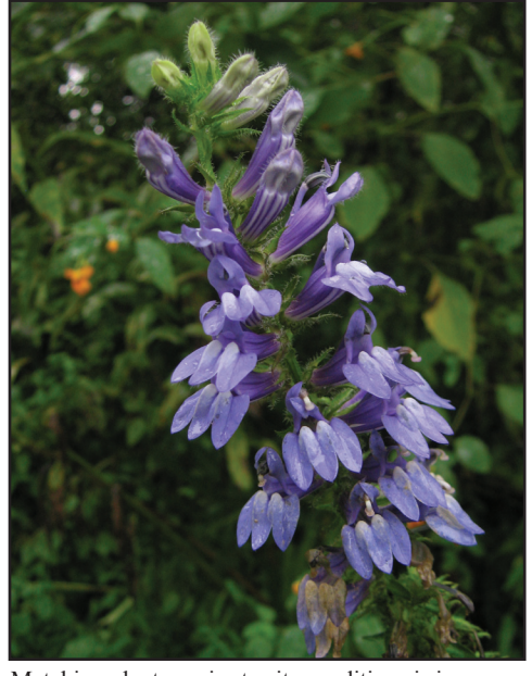
Matching plant species to site conditions is important. This great blue lobelia ( Lobelia siphilitica ) will only thrive in moist soils.

While it is useful to read about native plants, there is no substitute for getting out into the fields and woods to study them in person. As you learn more about each plant, its habitats, and its pollinators and other insect associates, you will be able to apply that knowledge to your own native plantings.