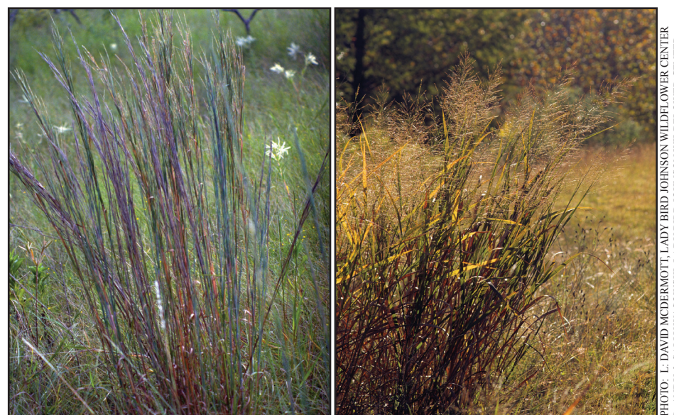
Warm-season grasses are critical to a successful meadow. For bee meadows, the smaller species like little bluestem (left) should be favored over large and agressive species like switchgrass (right).

Virginia Wild Rye ( Elymus virginicus ) is similar to the previous species, but adapted to wet areas, floodplains, and stream banks.