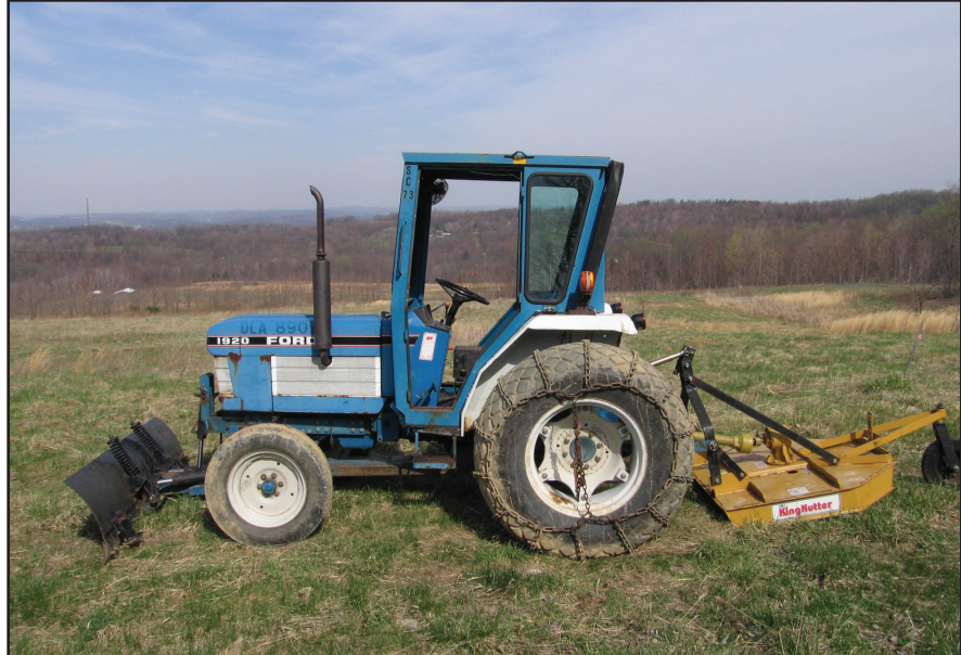
A flail mower or a rotary mower (shown here) may be used during the first year or two after planting to cut the tops off of fast-growing weeds without harming the slower-growing native seedlings. Be sure to set the mower to the proper height.

If plantings are properly established in the fall, watering should not be necessary during the subsequent growing season. Spring plantings can be susceptible to drought however, and may need to be watered regularly (every 1-2 weeks) during the first year until the plants are well established. It is necessary to mow herbaceous plantings to a height of 6-8" several times during the first growing season to remove the tops of the weeds that will inevitably grow faster than the desired perennials. Mow before the weeds reach 12" to avoid smothering the native seedlings with the cut thatch. A flail mower works best, since it chops the cut material and doesn't leave the windrows and clumps that a rotary mower leaves behind. A rotary mower can be used if a flail mower is not available.