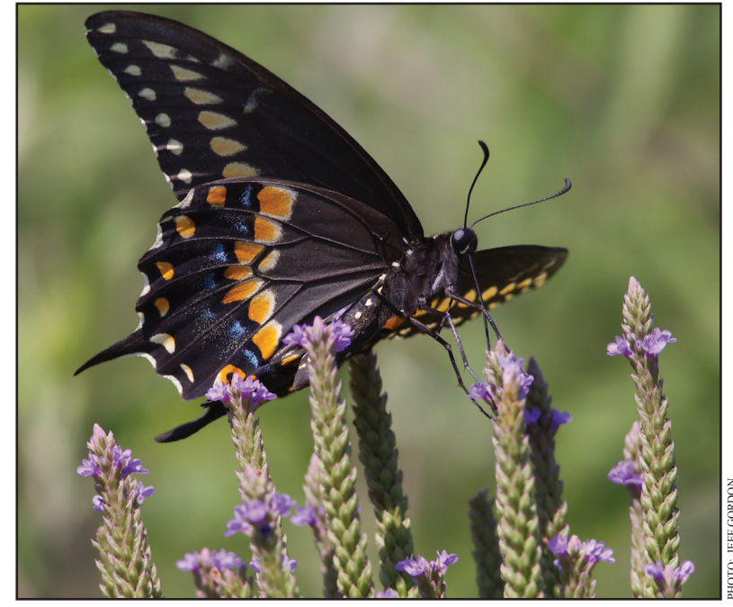
A bee meadow will also attract butterflies (such as this black swallowtail, Papilio polyxenes ) and other beneficial insects.

Bees benefit from patches of native flowering plants on farms, in home gardens, and in public spaces.