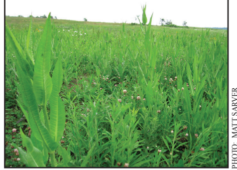
Incomplete weed control prior to planting can cause problems later.

7. Cultipack or roll the soil before seeding if using a drill, or after seeding if broadcasting.