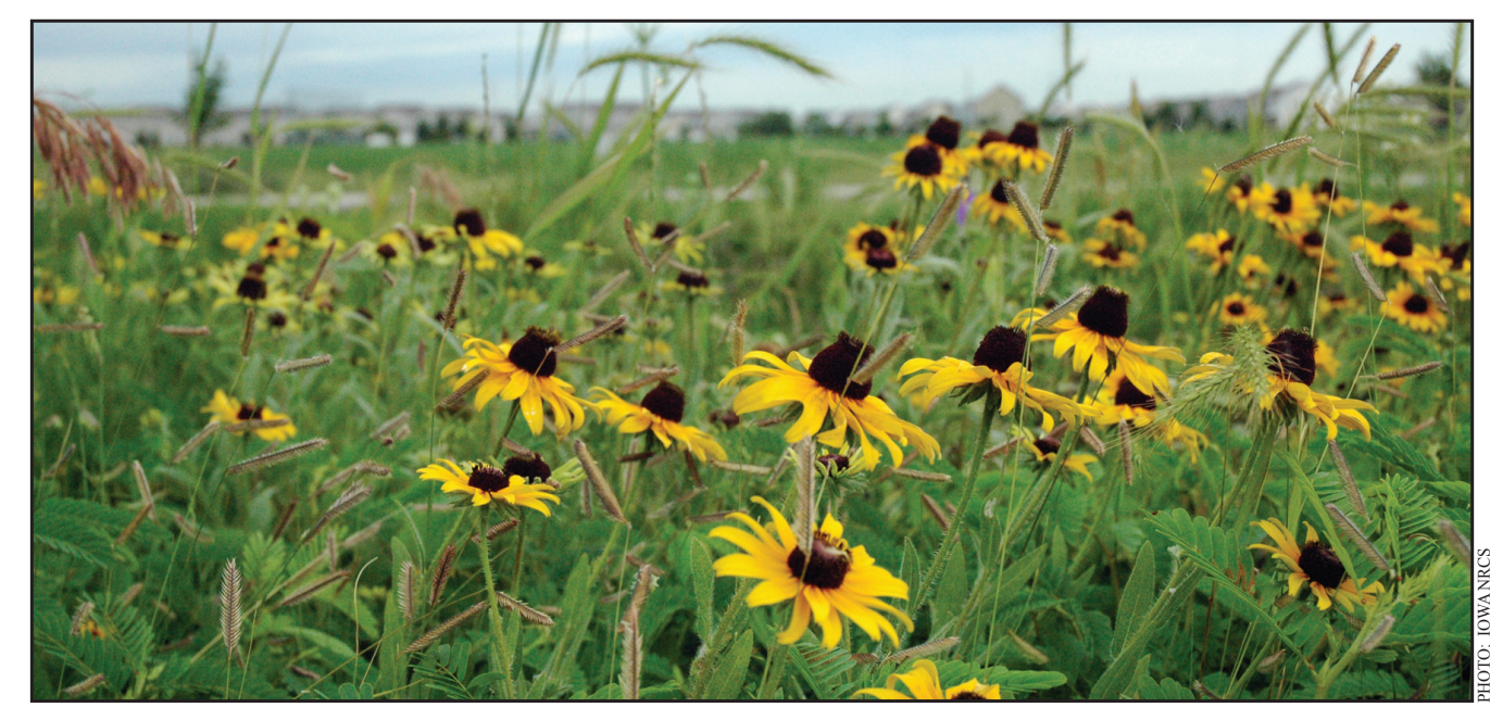
Black-eyed susan (Rudbeckia hirta) and partridge pea (Chamaecrista fasciculata) dominate a flush of early growth from a newly-planted meadow.

Contacts for NRCS are listed at the end of this fact sheet. Ask about how you can incorporate plantings for native bees into NRCS projects. The Delaware DNREC private lands biologist can assist you with finding public and private cost-share assistance for conservation projects. Delaware Department of Agriculture staff members are available to help you design bee habitat enhancements on your farm.