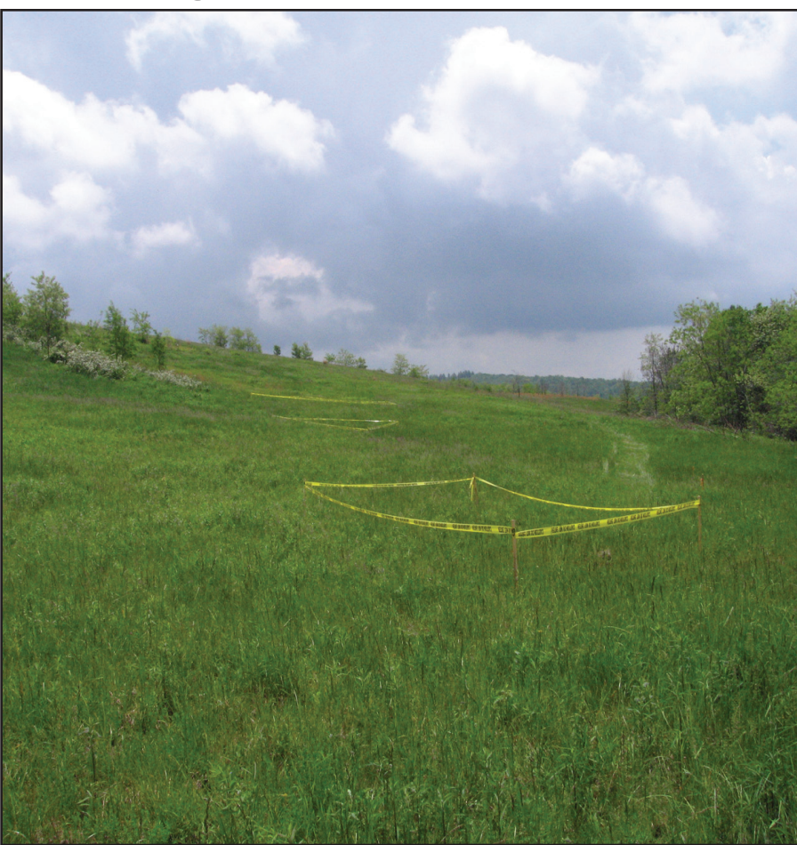
Low areas with standing water or saturated soils should be avoided during herbicide application unless applying a product approved for use in wetlands. Here, wet areas are cordoned off to avoid herbicide contamination during site preparation. These areas can be treated later with an appropriate product.

Cultivating to eliminate weeds is an alternative to spraying, particularly if a crop has been growing on the site or the soil has been recently disturbed. Cultivation may be performed alone, in or in combination with herbicide applications. If cultivation is the sole method of weed control, it often takes longer to achieve a clean site, and the control of perennial weeds may not be complete. One drawback to cultivation is the possibility of bringing dormant weed seeds from deeper soil profiles to the surface, where they will germinate.