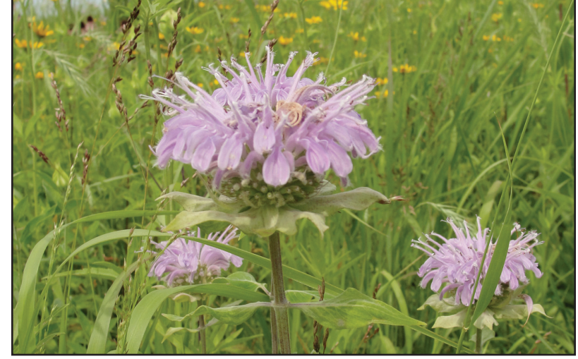
Pioneer species like this wild bergamot ( Monarda fistulosa ) establish quickly during the first season of growth, while more conservative species may not appear for several years.

An ecotype is a subpopulation of a species which is genetically differentiated so that its survival in a particular habitat or region is enhanced. In the native plant nursery trade, the ecotype is typically listed by state, and represents the original collection locality of the parent seed or stock used to produce a nursery or seed catalog offering. In order to maximize the probability of planting success, local ecotypes are preferred when available.