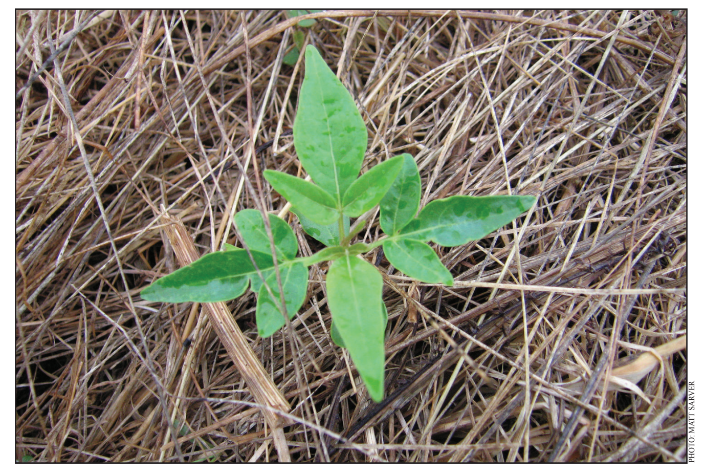
On disturbed grassy sites, seedlings of invasive species, like this Tree-of-Heaven ( Ailanthus altissima ), can be released from the seedbank when the initial spray kills the grass sod, allowing light to reach the dormant seeds. A second round of spraying is often necessary to control this sudden flush of weed seedlings.

throughout the site due to reduced competition from cool-season grasses and other vegetation. Species listed under state noxious weed laws should be controlled according to the regula-