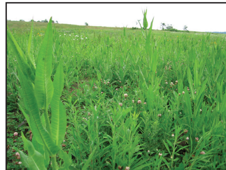
Incomplete weed control prior to planting can cause problems later.

7. Cultipack or roll the soil before seeding if using a drill, or after seeding if broadcasting.