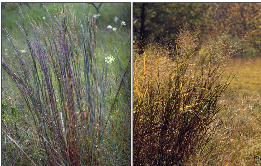
Warm-season grasses are critical to a successful meadow. For bee meadows, the smaller species like little bluestem (left) should be favored over large and aggressive species like switchgrass (right).

Virginia Wild Rye ( Elymus virginicus ) is similar to the previous species, but adapted to wet areas, floodplains, and stream banks.