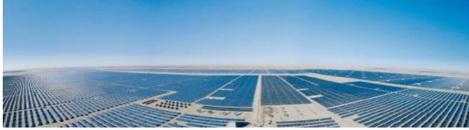
130MW in Geermu, Qinghai

“ONE STOP” energy consortium for the development of renewable energy globally