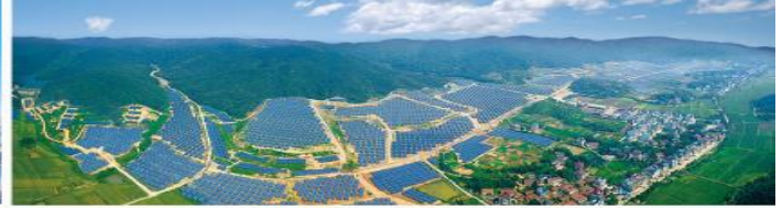
30MW in Jiangshan, Zhejiang