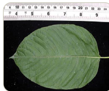
Leaf of kratom tree