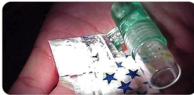
Ketamine in various forms