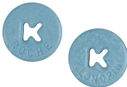
Klonopin 5mg tablet

Most depressants are controlled substances that range from Schedule I to Schedule IV under the Controlled Substances Act, depending on their risk for abuse and whether they currently have an accepted medical use. Many of the depressants have FDA-approved medical uses. In the United States, Rohypnol® and Quaaludes® are not manufactured or legally marketed, and have no accepted medical use.