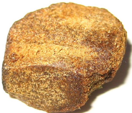
Marijuana concentrate

Marijuana concentrates can be mixed with various food or drink products to be consumed orally; however, smoking remains the most popular route of administration by use of water or oil pipes. A disturbing aspect of this emerging threat is the inhalation of concentrates via electronic cigarettes (also known as e-cigarettes) or vaporizers. Many marijuana concentrate users prefer the e-cigarette/vaporizer because it is smokeless, sometimes odorless, and easy to hide or conceal. The user takes a small amount of marijuana concentrate, referred to as a “dab,” then heats the substance using the e-cigarette/vaporizer producing vapors that ensures an instant “high” effect upon the user. Using an e-cigarette/vaporizer to inhale marijuana concentrates is commonly referred to as “dabbing” or “vaping.”