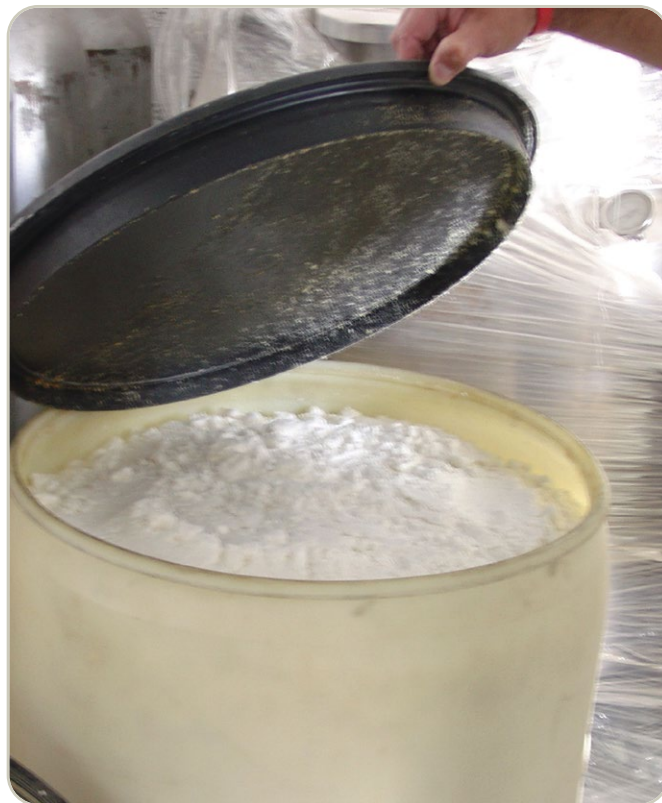
Methamphetamine in finished form

Regular meth is a pill or powder. Crystal meth resembles glass fragments or shiny blue-white “rocks” of various sizes.