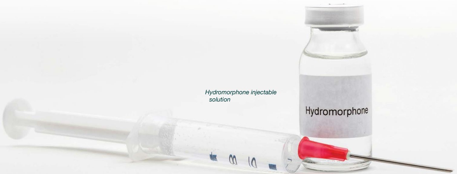
Hydromorphone injectable solution