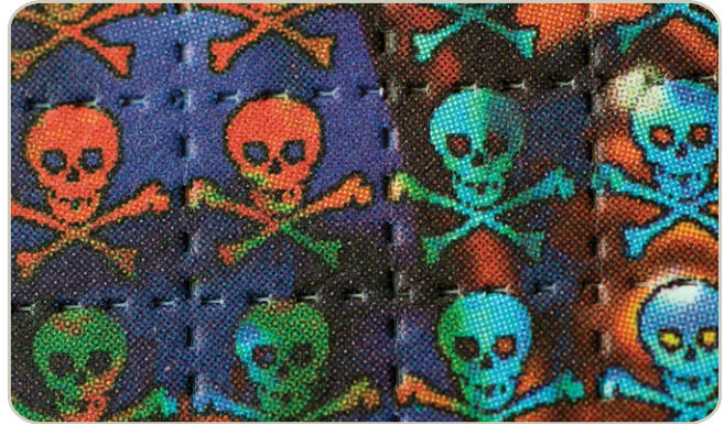
LSD blotter paper

During the first hour after ingestion, users may experience visual changes with extreme changes in mood. While under the influence, the user may suffer impaired depth and time perception accompanied by distorted perception of the shape