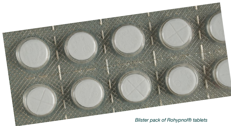
Blister pack of Rohypnol® tablets

Rohypnol® is a Schedule IV substance under the Controlled Substances Act. Rohypnol® is not approved for manufacture, sale, use, or importation to the United States. However, it is legally manufactured and marketed in other countries. Penalties for possession, trafficking, and distribution involving one gram or more are the same as those of a Schedule I drug.