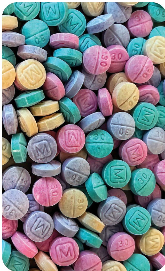
Fake rainbow oxycodone M30 tablets containing fentanyl

Fentanyl is a Schedule II narcotic under the United States Controlled Substances Act of 1970.