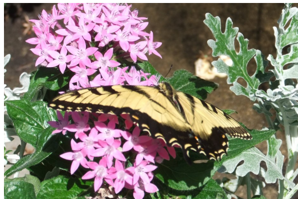
Tiger Swallowtail Butterfly on Pentas

Zinnias ( Profusion series) shorter variety