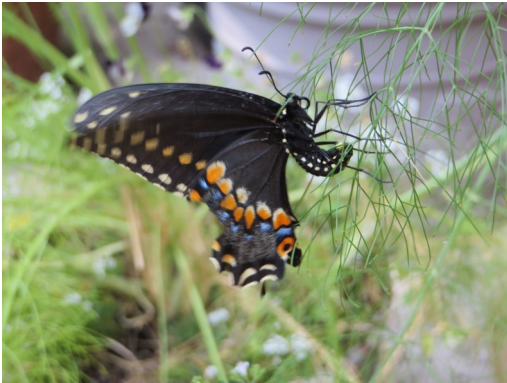
Black Swallowtail Laying Eggs on Fennel

For an easy planting design, plant taller plants in the center and then fill in with medium sized plants, allowing trailing plants to spill over the edge. After planting, be sure to watch the soil for even moisture. Keep in mind that containers dry out faster than gardens.