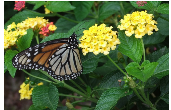
Monarch Butterfly on Lantana