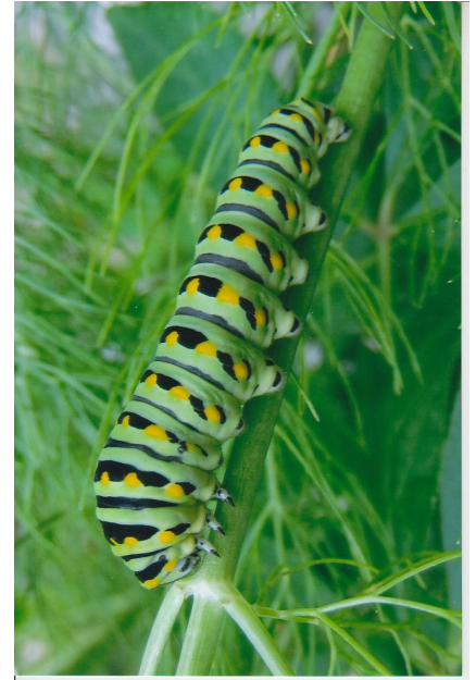
Black Swallowtail Caterpillar on Dill

Cleome ( Cleome hassleriana ) - host plant for Cabbage White Curry plant ( Helichrysum italicum ) - host plant for American Lady Dill ( Anethum graveolens ) - host plant for Black Swallowtail Fennel ( Foeniculum vulgare ) - host plant for Black Swallowtail Licorice plant ( Helichrysum petiolare ) trailing - host plant for American Lady Marigold ( Tagetes patula ) - host plant to Dainty Sulphur Parsley (Curled or Flat-leaved) - host plant for Black Swallowtail Snapdragon ( Antirrhinum majus ) - host plant for the Common Buckeye