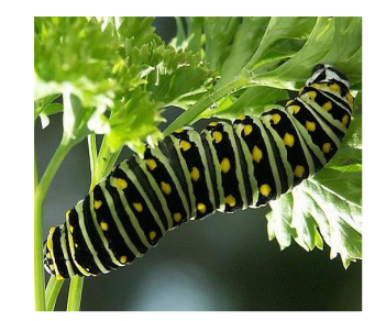
Black Swallowtail Caterpillar

arc-shaped hole in the leaf. Also, it will leave frass (caterpillar poop). When the caterpillar stops eating, it is about to shed its skin (molt) and should not be moved or disturbed. It will molt several times and often eats the skin. It should be noted that the Black Swallowtail caterpillar will change its appearance several times after molting before