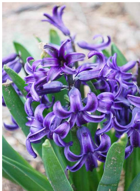
Left Hyacinth, Right Hyacinth 'Jan Bos'

The bulbs will rot in soil that stays wet or in an area that gets water logged. I've heard some people will dig up these bulbs after flowering and the leaves have died back. The bulbs are then stored until planting time in fall thereby preserving the bulbs against water logged soils. Nice in theory but I never seem to have time to dig up bulbs in spring, let alone store them for planting again in fall. Most of my hyacinth bulbs have been reliable for several years but I have noticed a few getting smaller blooms each year. Eventually they might disappear leaving me with no choice but to buy more bulbs in fall. Not really a bad thing come to think of it.