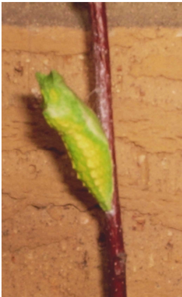
Black Swallowtail Chrysalis

Eastern Tailed Blue ( Everes Comyntas ) Meadow Fritillary ( Boloria bellona ) Silver-bordered Fritillary ( Boloria selene myrina ) Atlantis Fritillary ( Speyeria atlantis ) Silvery Checkerspot ( Chlosyne nycteis ) Pearl Crescent ( Phyciodes tharos ) White Admiral ( Limenitis arthemis arthemis ) Viceroy ( Limenitis archippus ) Red-spotted Purple ( Limenitis arthemis astyanax ) Northern Pearly Eye ( Enodia anthedon ) Little Wood Satyr ( Megisto cymela ) Appalachian Eyed Brown ( Satyrodes appalachia ) Eyed Brown ( Satyrodes eurydice eurydice )