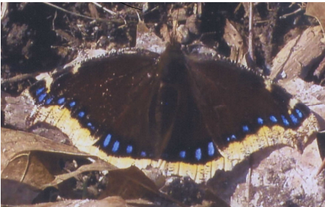
Mourning Cloak on leaf litter

Many butterflies survive Wisconsin winters by entering a state called "diapause." Their bodies manufacture an internal antifreeze that protects their cells and keeps them from freezing over the winter.