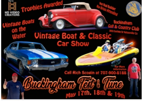
THIS IS GOING TO BE REALY GOOD!

Three days of fun surrounded by a gathering of Vintage Speed Boats Classic Cars and Trucks.