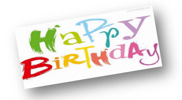
Wishing you a day of special moments for thankful remembering of all that has made your adventure of love a blessing and a joy.