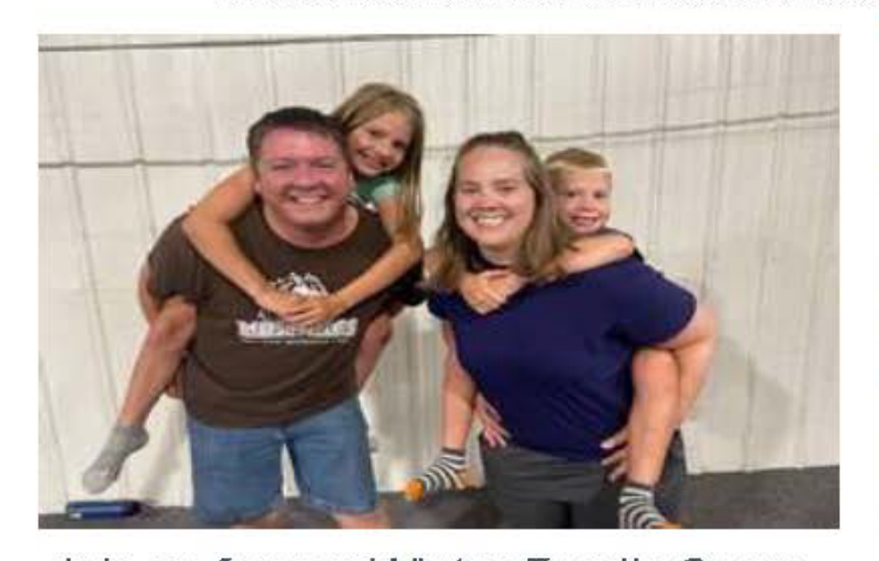
Join us for our Winter Family Camp