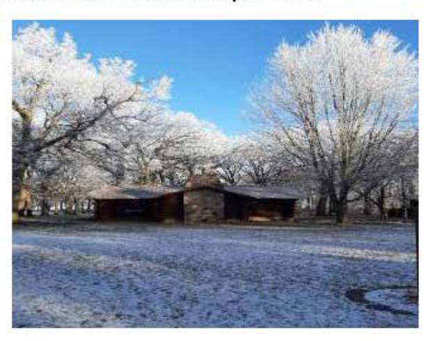
Or just come out and see the beauty of the season here.