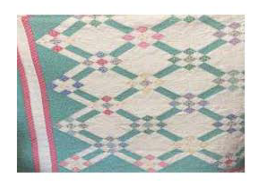
Check out our quilts online at Shetek.org