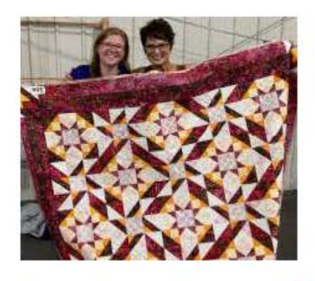
Thank you for another great Quilt Auction! We raised $43,646!!