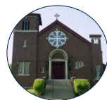
ST. PATRICK PARISH

603 MAIN STREET GUTHRIE CENTER, IA 50115