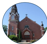
ST. MARY PARISH

603 MAIN STREET GUTHRIE CENTER, IA 50115