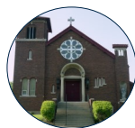
ST. PATRICK PARISH

603 MAIN STREET GUTHRIE CENTER, IA 50115