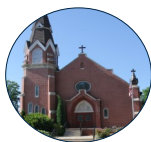
ST. MARY PARISH

603 MAIN STREET GUTHRIE CENTER, IA 50115