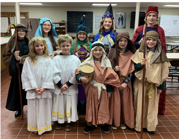
RE kids at St Patrick's Christmas program