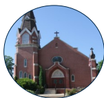
ST. MARY PARISH 603 MAIN STREET GUTHRIE CENTER, IA 50115