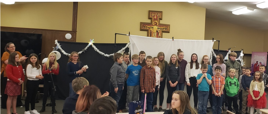
RE kids at St Mary's Christmas program