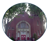
ST. CECILIA PARISH

Free-will offering for GC Association of Churches