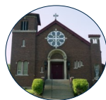
ST. PATRICK PARISH

603 MAIN STREET GUTHRIE CENTER, IA 50115