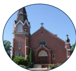
ST. MARY PARISH

603 MAIN STREET GUTHRIE CENTER, IA 50115