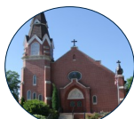
ST. MARY PARISH

603 MAIN STREET GUTHRIE CENTER, IA 50115