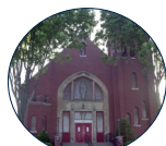
ST. CECILIA PARISH

Casey's Center Des Moines, IA (Formerly Wells Fargo Arena)