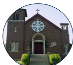
ST. PATRICK PARISH

603 MAIN STREET GUTHRIE CENTER, IA 50115