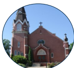
ST. MARY PARISH

603 MAIN STREET GUTHRIE CENTER, IA 50115