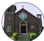
ST. PATRICK PARISH

603 MAIN STREET GUTHRIE CENTER, IA 50115