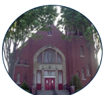
ST. CECILIA PARISH