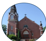
ST. MARY PARISH

603 MAIN STREET GUTHRIE CENTER, IA 50115