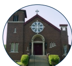
ST. PATRICK PARISH

603 MAIN STREET GUTHRIE CENTER, IA 50115