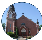
ST. MARY PARISH 603 MAIN STREET GUTHRIE CENTER, IA 50115