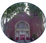
ST. CECILIA PARISH 220 N 1ST ST. PANORA, IA 50216

Watch the bulletin for further information in the coming weeks.