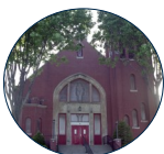
ST. CECILIA PARISH