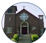
ST. PATRICK PARISH

603 MAIN STREET GUTHRIE CENTER, IA 50115