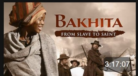
Bakhita: From Slave to S...