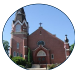
ST. MARY PARISH

603 MAIN STREET GUTHRIE CENTER, IA 50115