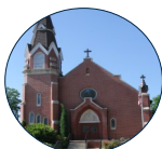
ST. MARY PARISH 603 MAIN STREET GUTHRIE CENTER, IA 50115