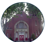
ST. CECILIA PARISH