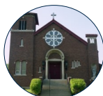
ST. PATRICK PARISH

603 MAIN STREET GUTHRIE CENTER, IA 50115