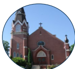
ST. MARY PARISH

603 MAIN STREET GUTHRIE CENTER, IA 50115