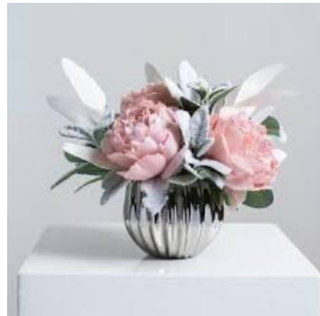
Miniature design