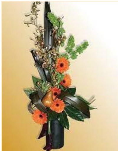
Line Mass arrangement