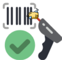
Handheld Sampling Device with Touchscreen