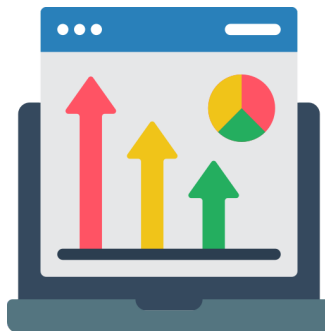
Sampling Management Web Application