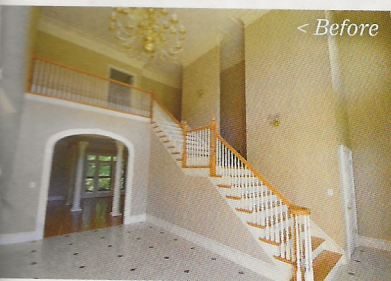
< Before | After >