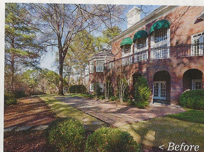
< Before | After >