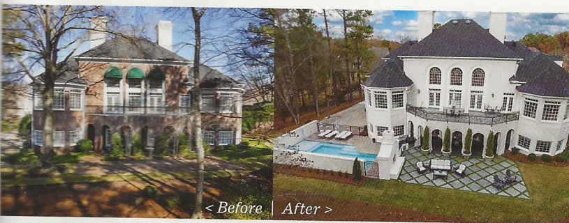
< Before | After >