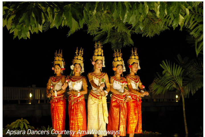
Apsara Dancers

Head Office 4603 Main Street, Vancouver, BC V5V 3R6, Canada Tel: 604-291-1332 or 1800-665-0998 Email: sti@sticanada.com Website: sticanada.com BC Reg #23625