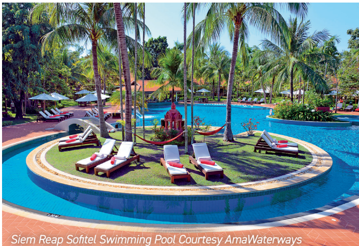
Siem Reap Sofitel Swimming Pool

Any air carrier providing transportation in connection with these tours is not to be held responsible for any act, omission or event during the time the passenger is not on board its planes. The passenger contract in use by the airlines concerned, when issued, shall constitute the sole contract between the airline and the purchase of these tours and/or passenger. Similar responsibility as noted applies to all types of carriers, including car rental companies.