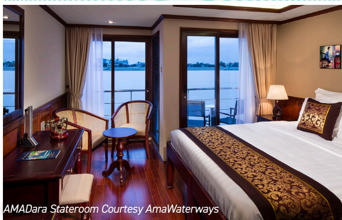
AMADara Stateroom