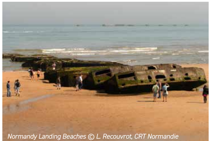
Normandy Landing Beaches