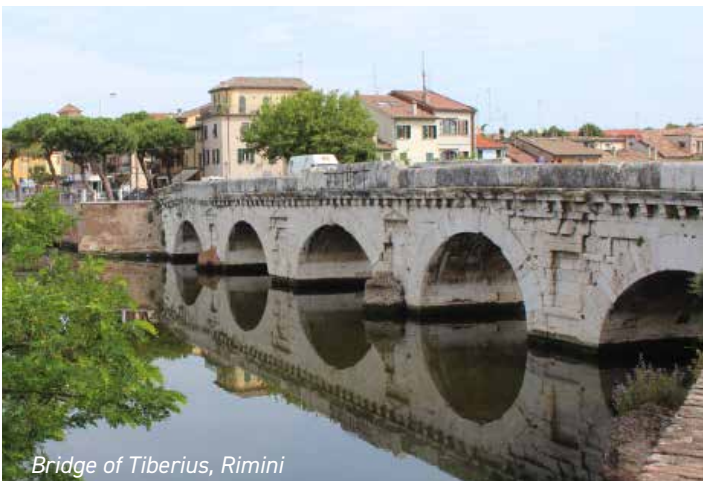
Bridge of Tiberius, Rimini

Should you wish to make your own flight arrangements, extend etc., availability and costs change continuously. If you wish to secure specific flights at a certain cost, you will have to book/pay for your flights at the same time.