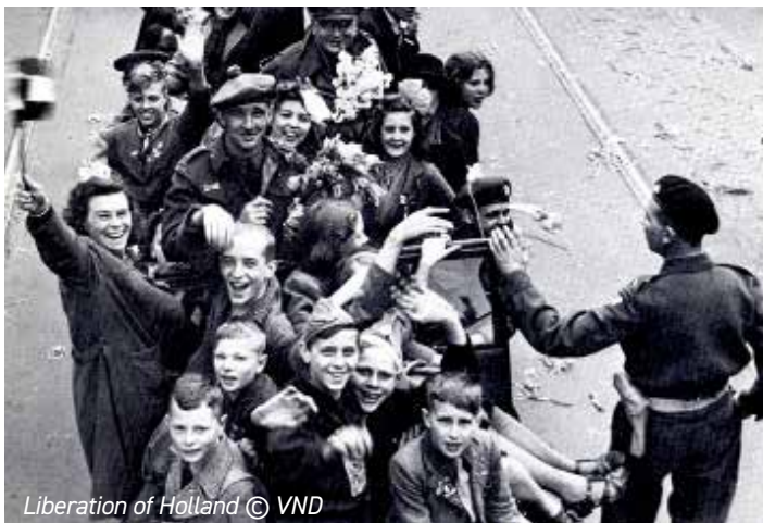
Liberation of Holland