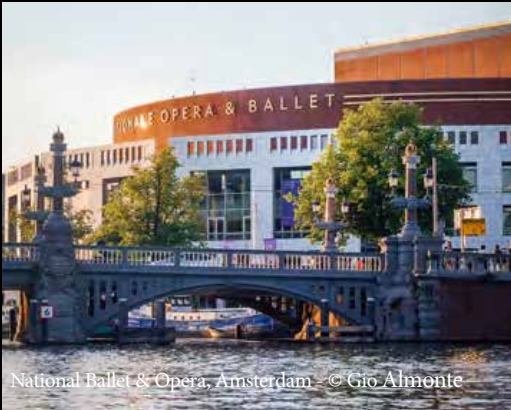
National Ballet & Opera, Amsterdam