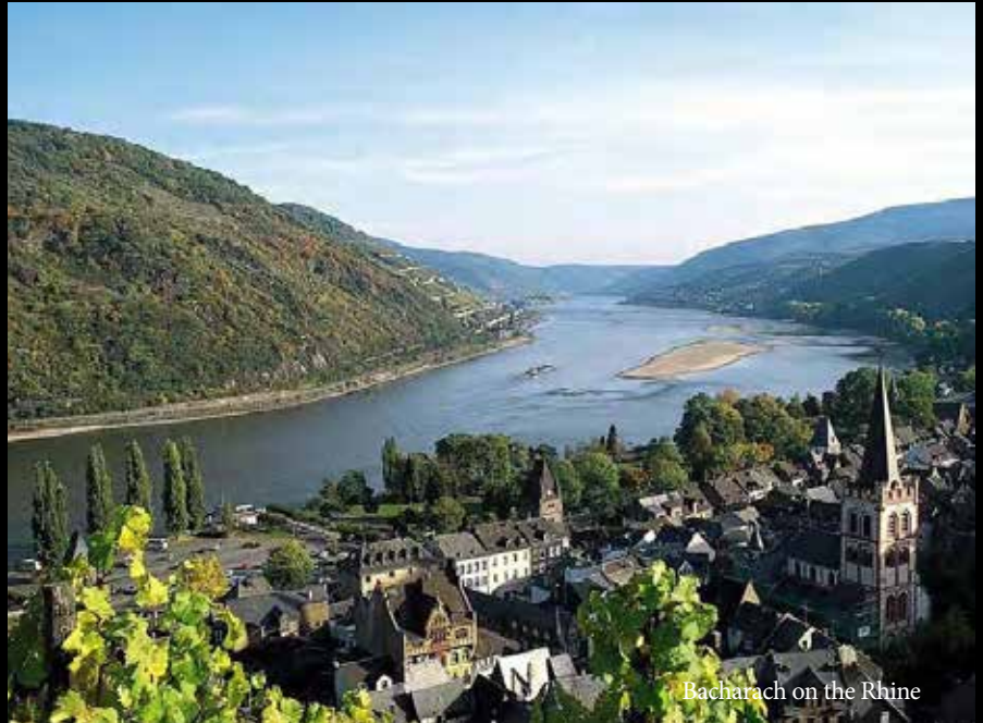
Bacharach on the Rhine