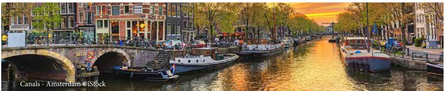
Canals - Amsterdam