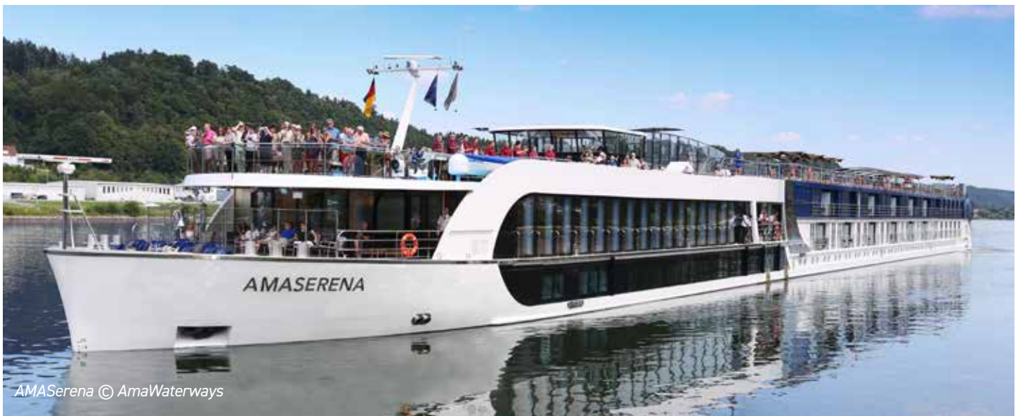
AMASerena

AIRLINE RESPONSIBILITY: Any air carrier providing transportation in connection with these tours is not to be held responsible for any act, omission or event during the time the passenger is not on board its planes. The passenger contract in use by the airlines concerned, when issued, shall constitute the sole contract between the airline and the purchase of these tours and/or passenger. Similar responsibility as noted applies to all types of carriers, including car rental companies.