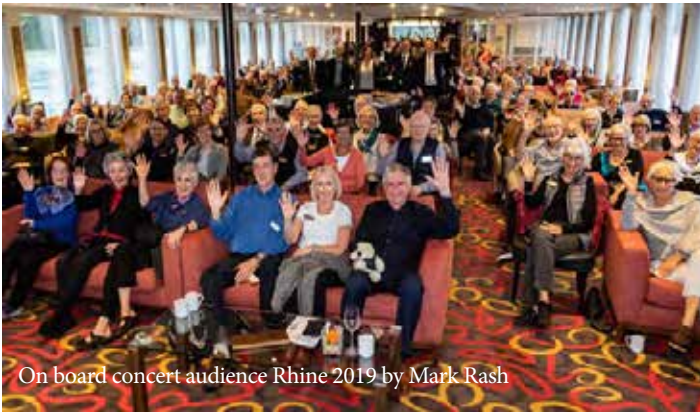
On board concert audience Rhine 2019