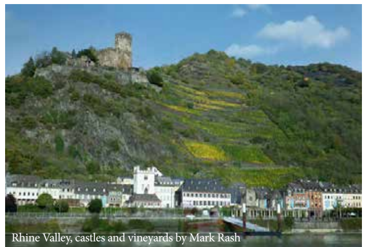
Rhine Valley, castles and vineyards

Performance details are preliminary and subject to change; slight adjustments to our sightseeing programme may have to be made once performance schedule is finalized.