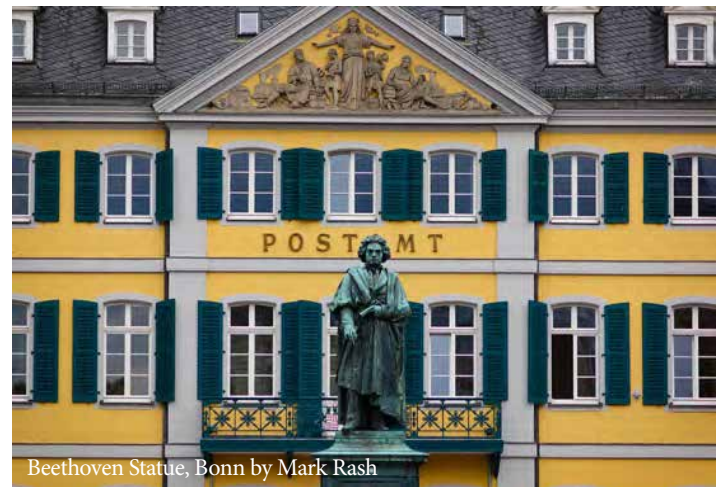
Beethoven Statue, Bonn