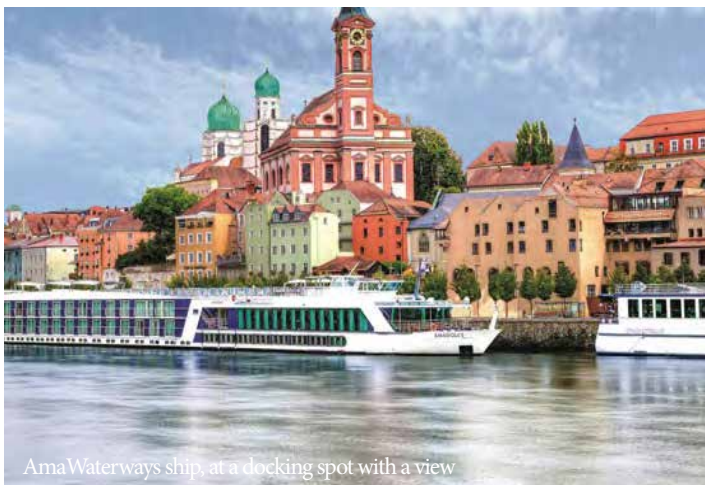
AmaWaterways ship, at a docking spot with a view

Strasbourg, the capital city of Alsace, offers flavours of both France and Germany because of its borderline location. We'll enjoy a panoramic tour past the stunning Parc de l'Orangerie, the European Parliament and the Place de la République before walking through the iconic "La Petite France" district, which appears to have been lifted straight from the pages of a fairytale. Wander through these charming streets and past the Cathédrale de Notre Dame with its famous astronomical clock. Alternatively, the active adventurer can take a guided bike ride through the city and Parc de l'Orangerie. (B,L,D)