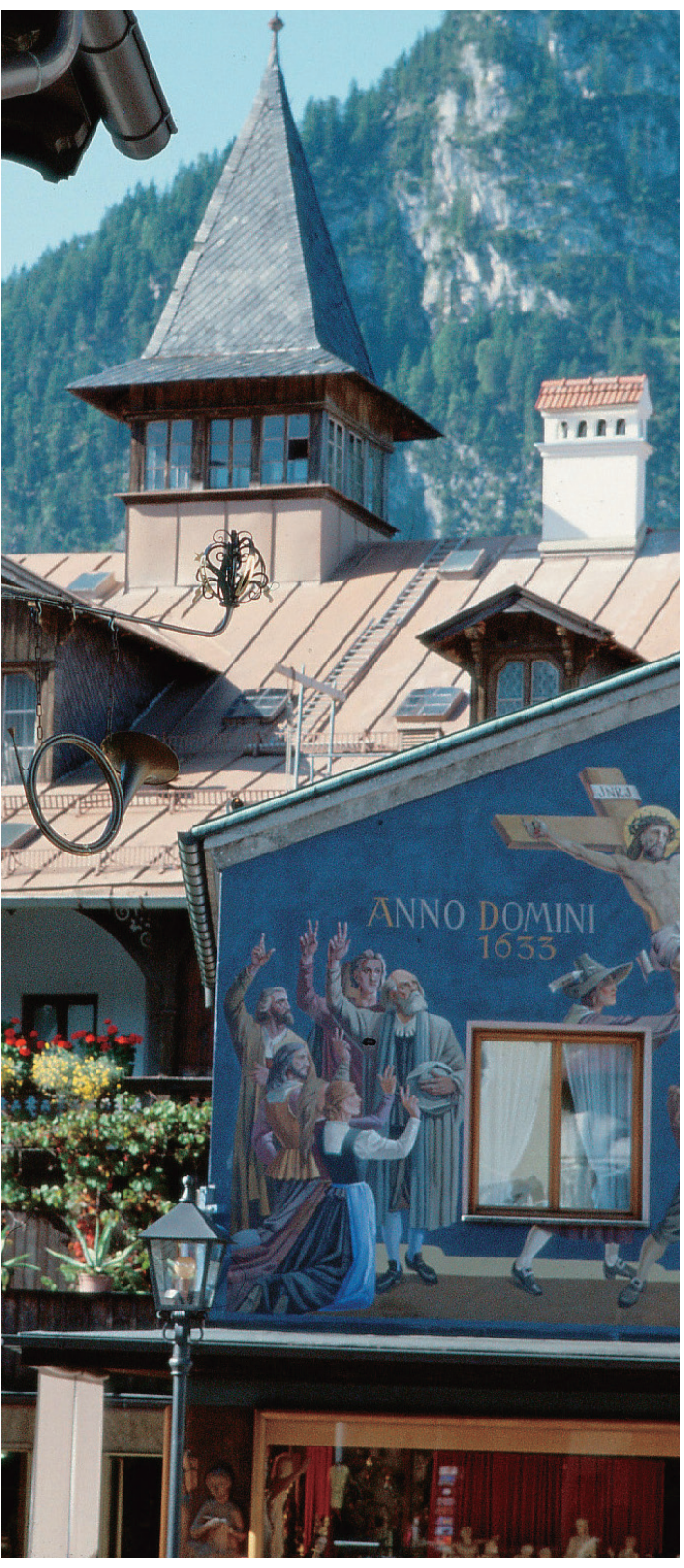
Houses, Oberammergau