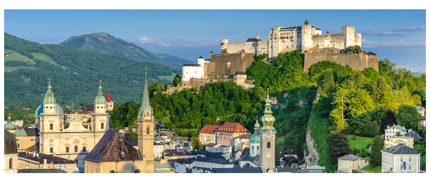
Fortress Hohensalzburg and the Old Town of Salzburg

Enjoy a guided tour of Salzburg, Mozart's hometown. In the afternoon, visit the lakeside village of Mondsee and picturesque