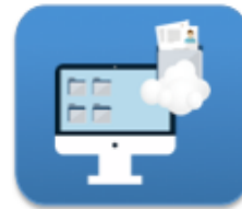
Project / Case Management