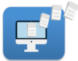
Client / Contact Management