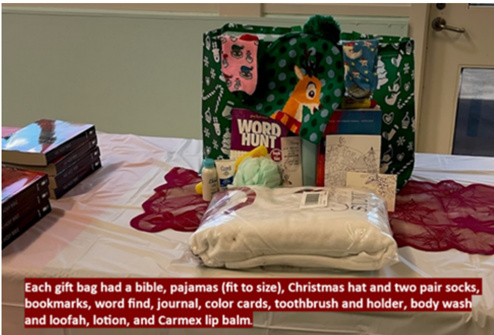
Each gift bag had a bible, pajamas (fit to size), Christmas hat and two pair socks, bookmarks, word find, journal, color cards, toothbrush and holder, body wash and loofah, lotion, and Carmex lip balm.

We ended the year with a wonderful Christmas party for 23 girls and 15 staff. We served a delicious Publix deli lunch of four sub trays, two fruit trays, two topping trays, and all the extras like: chips, cookies, tea, and lemonade. We distributed 23 of the 30 gift bags, and the remaining 7 were left to give to girls that would come later.