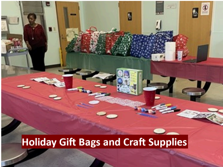
Holiday Gift Bags and Craft Supplies