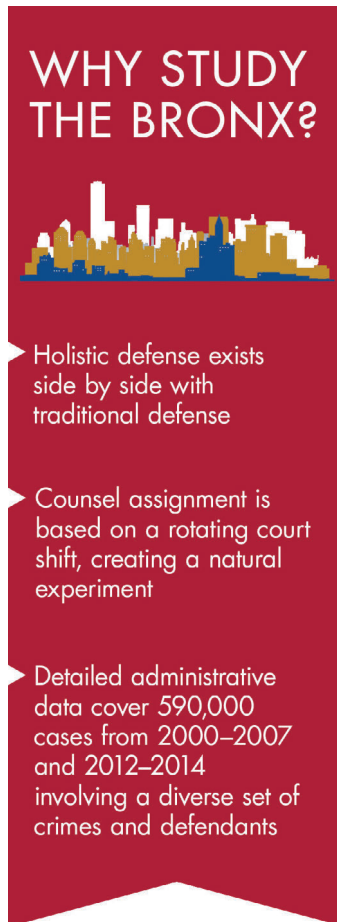
Figure 2. Choosing the Bronx